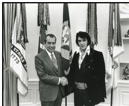
It's like déjà vu all over again